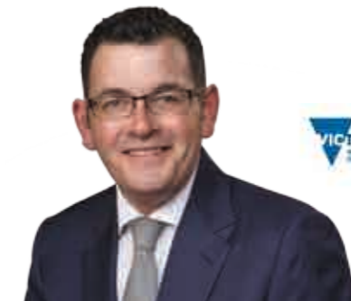
The Hon Daniel Andrews MP Premier

On behalf of the Victorian Government, I wish everyone at the Jewish Community Council of Victoria, and all of Victoria's Jewish community, a successful year ahead.