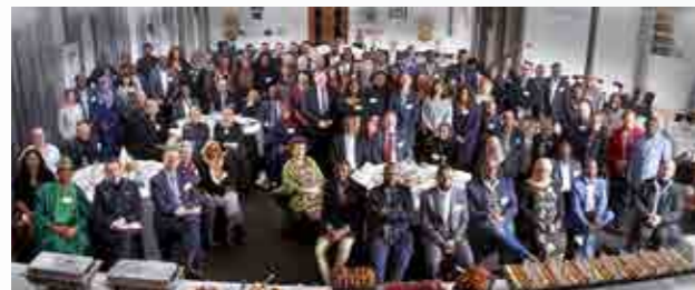
Young Australia Israel Chamber of Commerce, the Jewish Holocaust Centre and the National Council of Jewish Women.